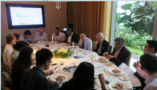
IMAS Media Lunch

The Development Committee pursues initiatives and collaborations to enhance the development of the investment management industry in Singapore. These initiatives aim to address infrastructural gaps, improve industry practices, and provide further support for industry growth. In FY2017/18, the Committee focused its efforts on organising a series of Financial Technology-related (FinTech) talks, continued its push for corporate stewardship in Singapore, updated members on the obligations and benefits of the FX Global Code, surveyed members on their markets and business outlook for calendar year 2018, and hosted Lunchtime Talks and events that addressed trending issues.