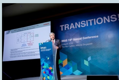
IMAS 19th Annual Conference