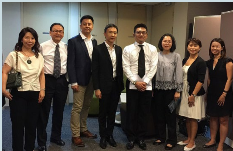
5th IMAS Regulatory/Legal Round-up Forum

The Regulatory Committee held Roundtables and Forums throughout the Financial Year 2017/2018 for IMAS members to highlight and discuss the potential impact of various local and global regulatory changes on the fund management industry. The Regulatory Committee has also directly engaged with the relevant bodies to clarify members' concerns, put forth proposals and provide general comments on consultations. Upcoming legislation such as the Singapore Variable Capital Company (S-VACC) has also generated significant interest among members.