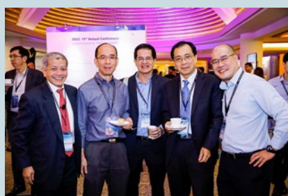
IMAS 19th Annual Conference