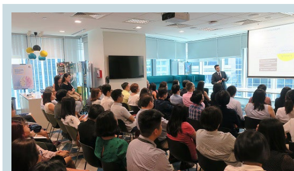
FX Global Code Lunch Time Talk

The Regulatory Committee will continue in its efforts to engage the fund management industry in promoting and facilitating pragmatic implementation of regulatory policies and sharing of best practices and knowledge in the next Financial Year.