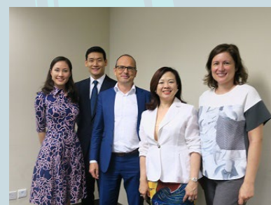
WWF Responsible Fund Managers Masterclass Speakers

The Committee is grateful for the continued support and participation by IMAS members and is encouraged in its efforts to enhance the professional capabilities of IMAS through strengthening its industry educational activities and programmes in the new financial year.