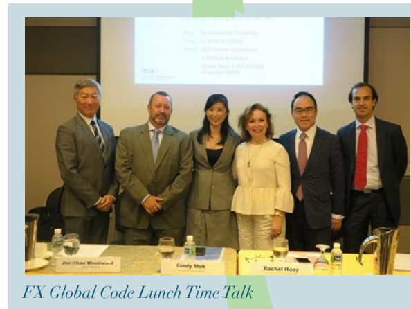
FX Global Code Lunch Time Talk

A Lunchtime Talk, titled Learn how the new Foreign Exchange Global Code (FX Global Code) will impact your firm's currency trading and settlement , was held on 31 October 2017. Representatives from the MAS, banks and member firms provided insights into the handling of orders and limits, e-trading platforms rules, and circumstances which may necessitate pre-hedging of orders. Furthermore, the Committee had also prepared for the revision of The Singapore Guide to Conduct and Market Practices for the Wholesale Financial Markets (also known as “the Blue Book”), convening internally and engaging with the Singapore Foreign Exchange Market Committee (SFEMC) to raise members’ concerns. Among the issues raised was the potential of repetition between the Blue Book and FX Global Code. The feedback sessions eventually resulted in the revised publication of the Blue Book on 12 April 2018, with a supporting Frequently Asked Questions document to note how the Blue Book would interact with the FX Global Code.